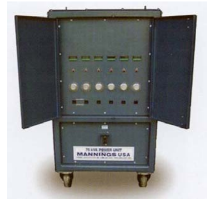
Semi Automatic Model Stock No. 11126