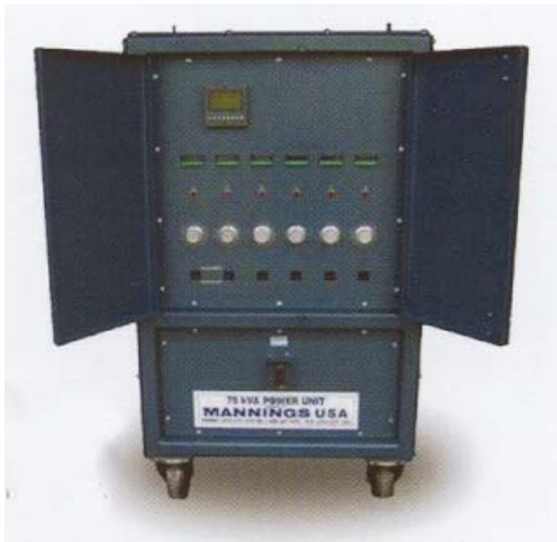
Fully Automatic Model with built in programmer and communications ready. Stock No. 12126