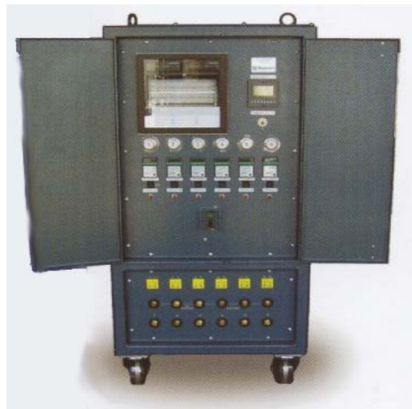
Heat Treatment Center Model with programmer, recorder, ammeters and communications ready. Stock No. 16126